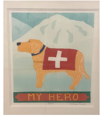
The SLP department received print, above, from the grateful patient. Both the patient and the clinician are animal lovers so the gift is very fitting. The accompanying note read, "if you were a canine, you would be a golden retriever. Goldens are goodness on earth."

"My speech-language pathologist (SLP) combined professionalism with compassion. Her insight into the overall experience was matched by her expertise. I feel as though my goals can be achieved with her guiding me. A plan was clearly defined, then she explained and confirmed that I understood what we were doing. The environment that was created made me feel comfortable and safe. MGH SLPs demonstrated that they truly understood the social aspect of what head and neck cancer patients experience. This made me feel human."